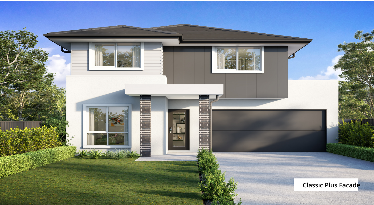
Classic Plus Facade