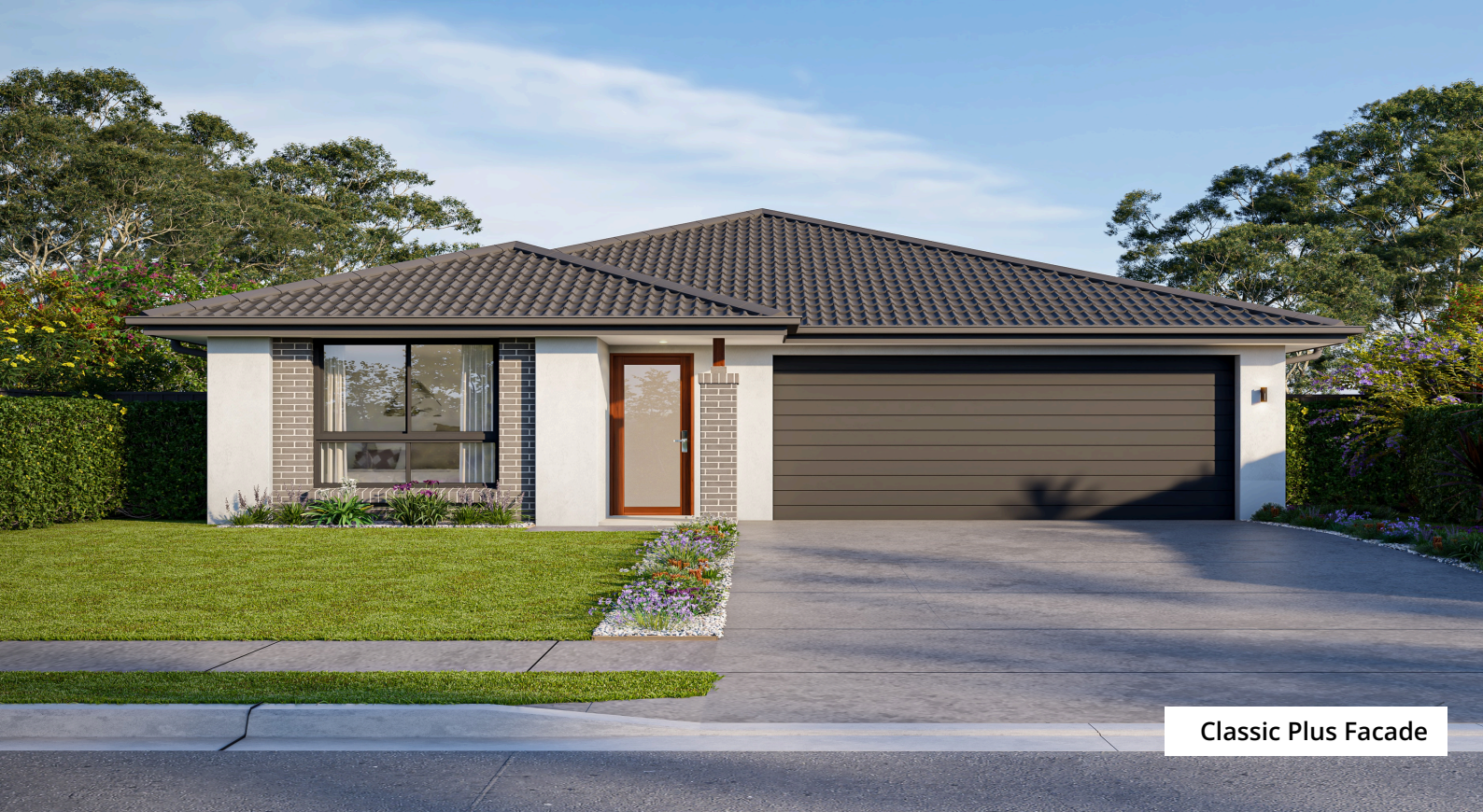
Classic Plus Facade